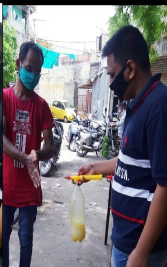
Bridge, Datta Wadi, Chalisgaon, Maharashtra 424101, India Latitude 20.4596637° Longitude 75.0119864° Local 12:29:07 pm Altitude 258 meters GMT 06:59:07 am Saturday, 04-07-2020