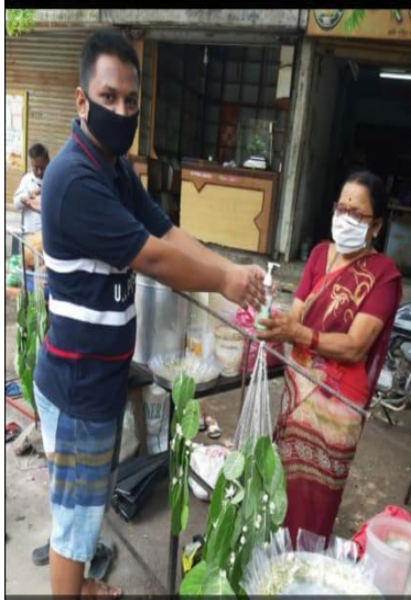
Sahyadri Lodge, Shivaji Ghat Rd, Hanuman Wadi, Chalisgaon, Maharashtra 424101, India Latitude 20.4597581° Longitude 75.0120604° Local 12:38:38 pm Altitude 275 meters GMT 07:08:38 am Saturday, 04-07-2020