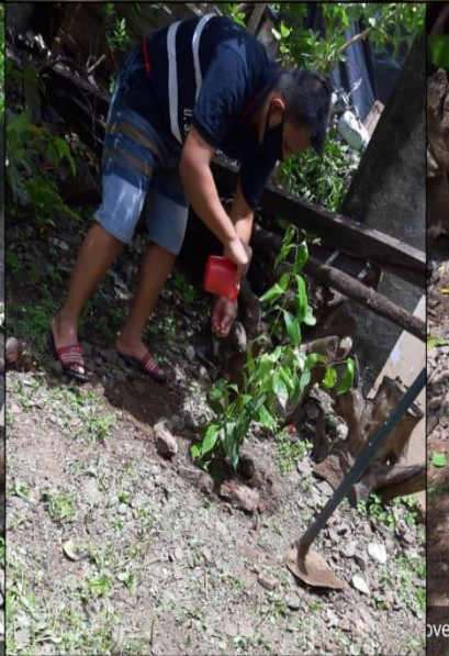
Bridge, Datta Wadi, Chalisgaon, Maharashtra 424101, India Latitude 20.4596637° Longitude 75.0119992°