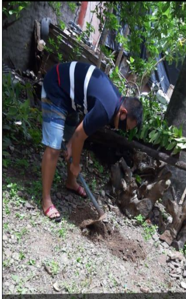
Flyover Bridge, Datta Wadi, Chalisgaon, Maharashtra 424101, India Latitude 20.4596742° Longitude 75.0119514°