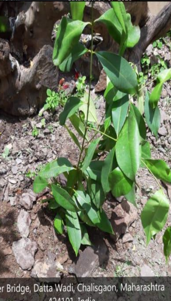
Bridge, Datta Wadi, Chalisgaon, Maharashtra 424101, India Latitude 20.4596637° Longitude 75.0119187° Local 12:29:07 pm Altitude 238 meters GMT 06:59:07 am Saturday, 04-07-2020