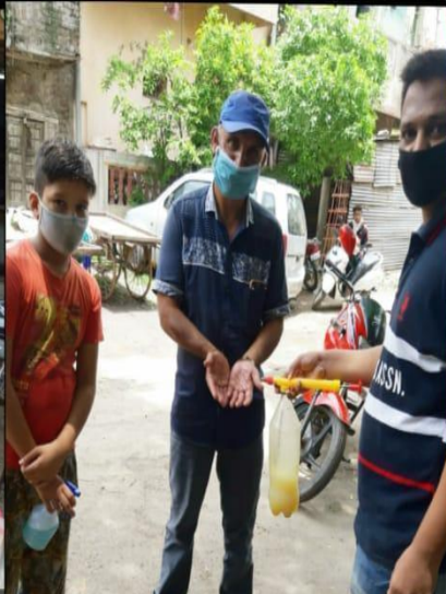
Flyover Bridge, Datta Wadi, Chalisgaon, Maharashtra 424101, India Latitude 20.4597348° Longitude 75.0120499°