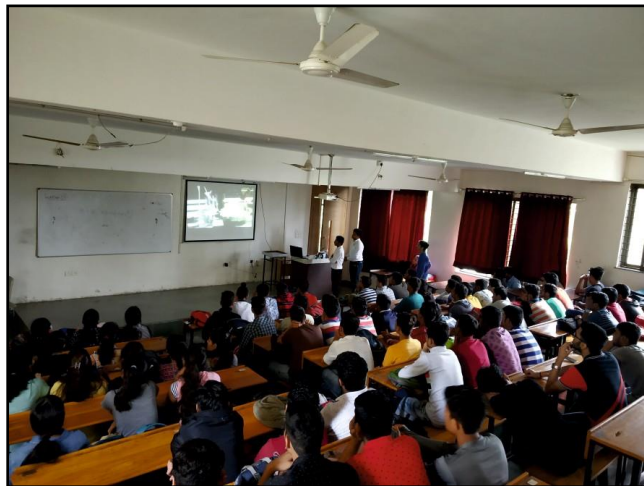
Vehicle Dynamics Workshop