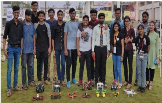
Air-O-task, Drone competition