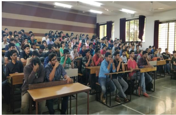
Orientation Session for all Branches