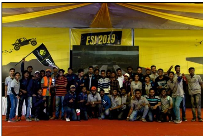
Enduro Student India 2019