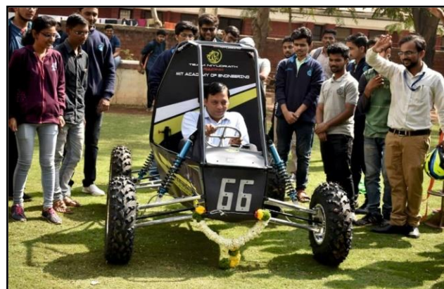
ATV Inaugural Function