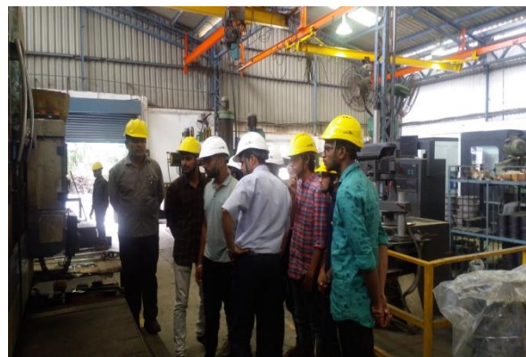
Industrial Visits to Parle G , Vadagaon Maval , & Poona Coupling , Pirangut ,Pune