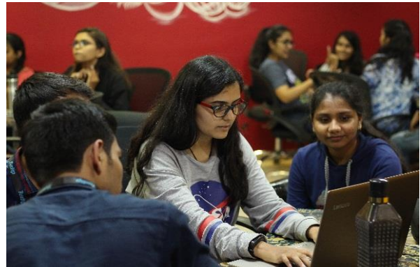
Bootcamp : LetsPy