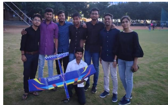
SAE Aero Design Challenge workshop