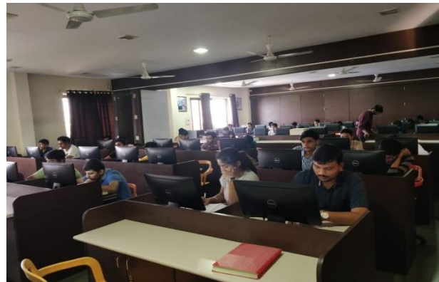
Online Test in CNL Lab, Computer Dept.