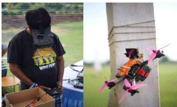
TESSERACT, IDRL, Gujarat