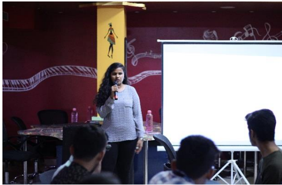
Bootcamp : LetsPy