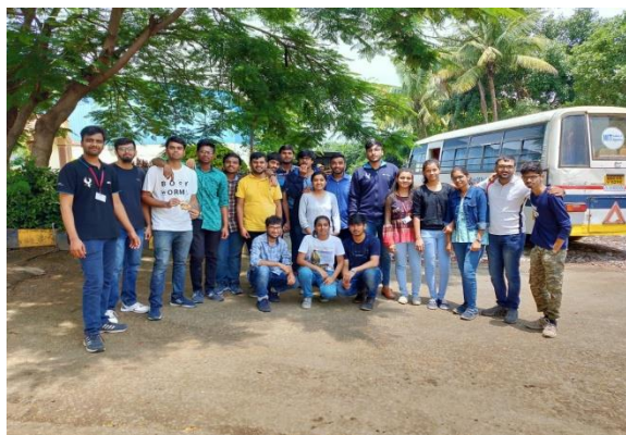
Industrial Visits to Parle G , Vadagaon Maval , & Poona Coupling , Pirangut ,Pune