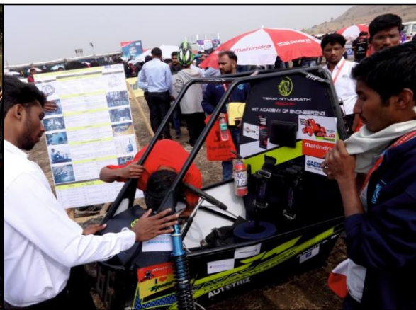
BAJA SAE INDIA 2019