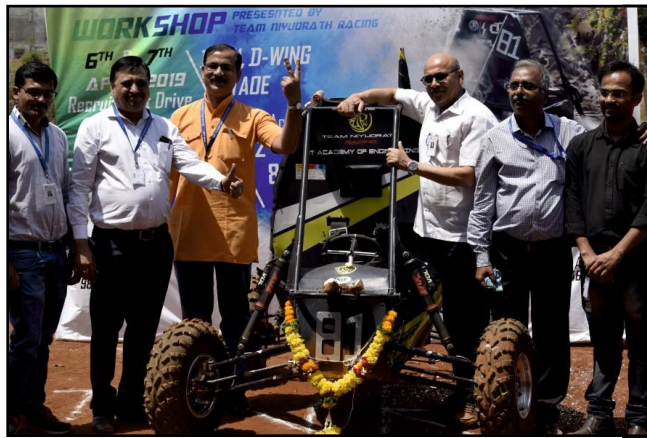
Dynamic Hurl (Stunt Show)