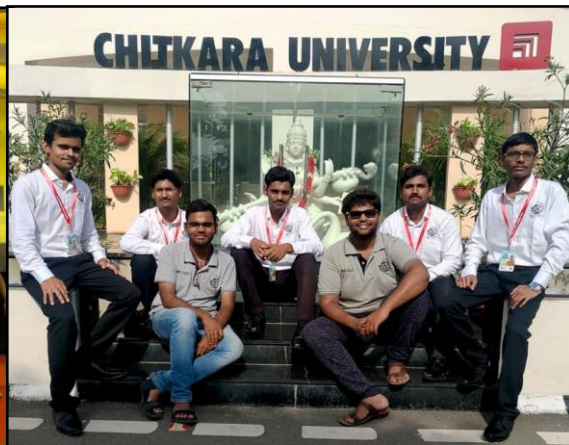
BAJA SAE INDIA 2019