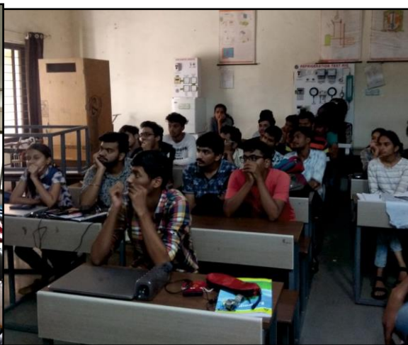
Summer Internship Programme