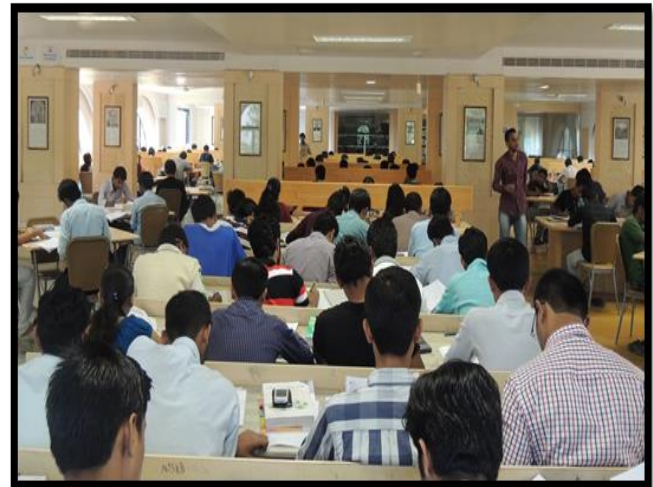
Photo No. 12 Reading Hall