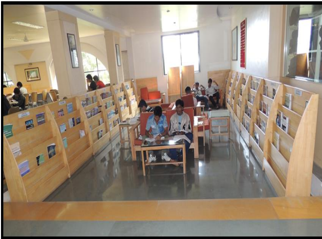
Photo No. 09 Periodical Section