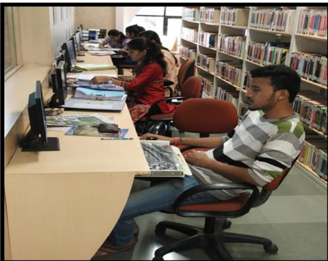
Photo No. 05 Multimedia & Digital Section