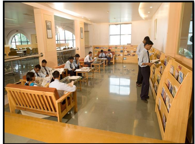
Photo No. 10 Periodical Section