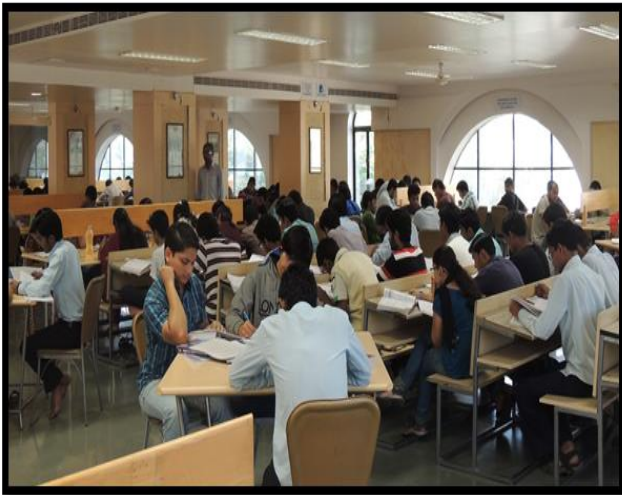
Photo No. 13 Reading Hall