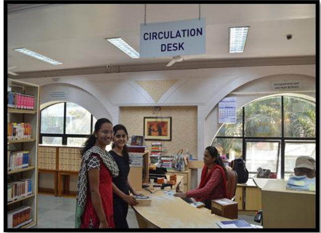
Photo No. 02 Circulation Section