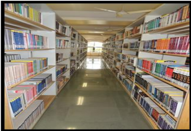
Photo No. 03 Stack Section