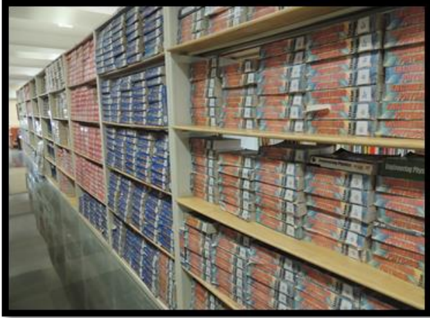
Photo No. 07 Book Bank