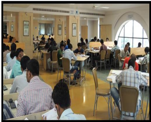
Photo No. 14 Reading Hall