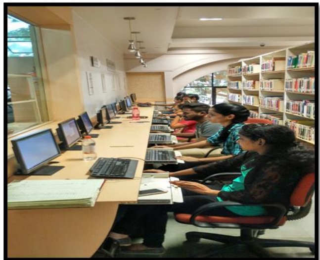
Photo No. 06 Multimedia & Digital Section