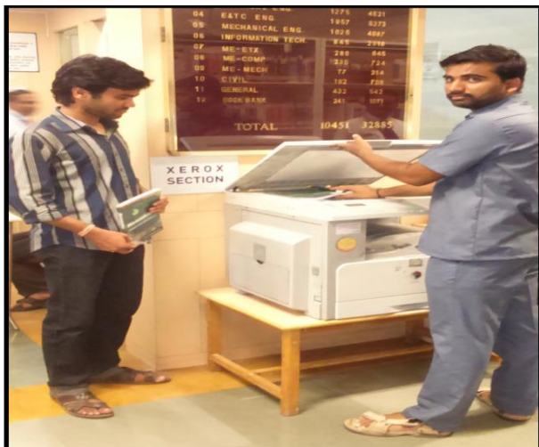
Photo No. 11 Xerox Section