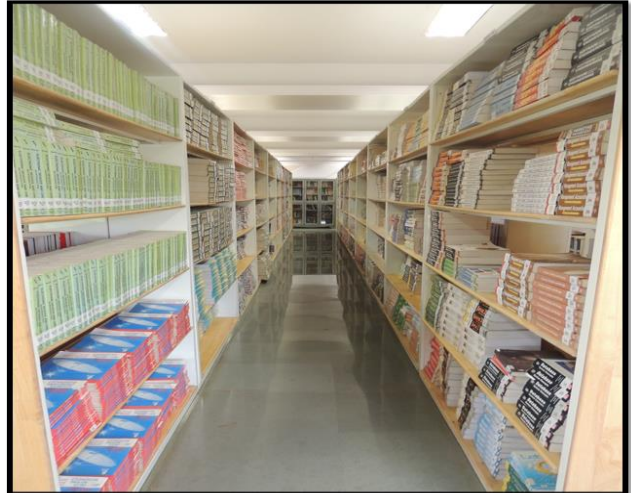
Photo No. 08 Book Bank