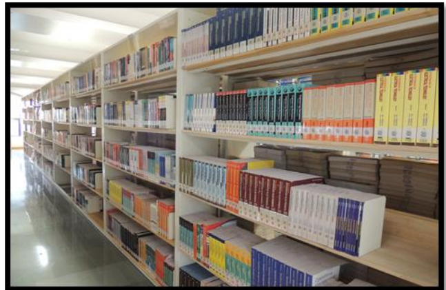
Photo No. 04 Stack Section