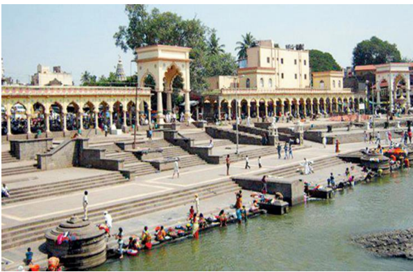
Ghat Cleanliness activity