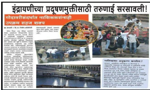
Awareness of Ghat cleanliness