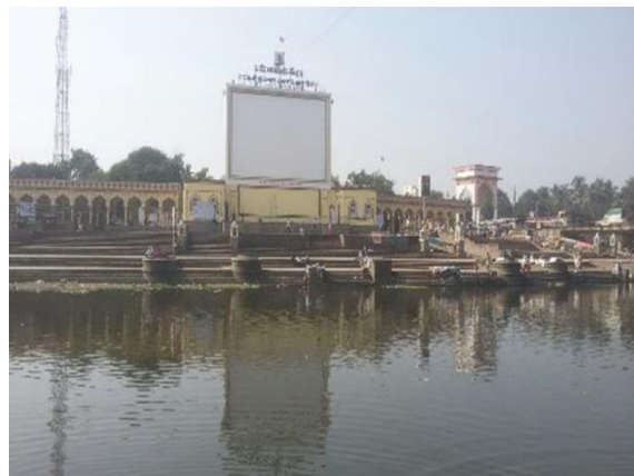
Snap shot of Indrayani ghat