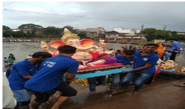
Avoid water pollution by removing ganesh idol