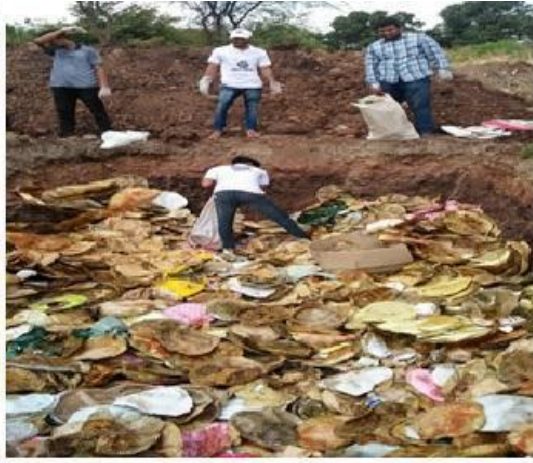
Clenliness during Ashadi wari by disposal of plates into dug hole