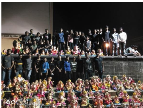
Ganapati Visarjan Pollution control