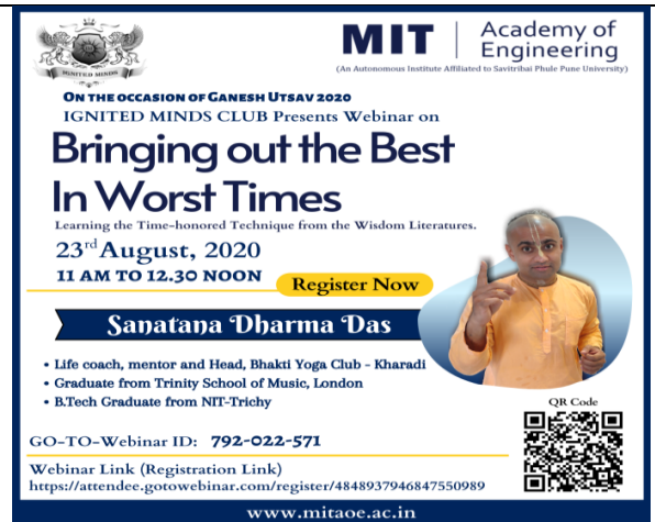
Guest lectures on ethics, values, duties, and responsibilities and on saving the environment.