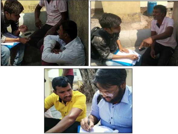
Fig 2: Interaction with Farmers