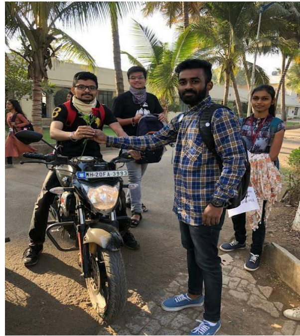
Spreading awareness regarding the road safety among the youth