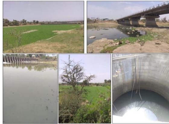
Fig 5: Available Water Sources in Nirgudi Village