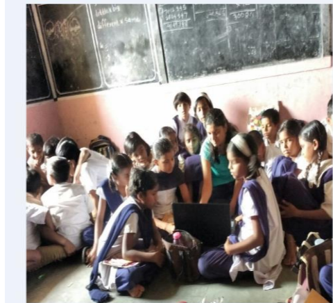
Social activities conducted by computer department teaching IT skill