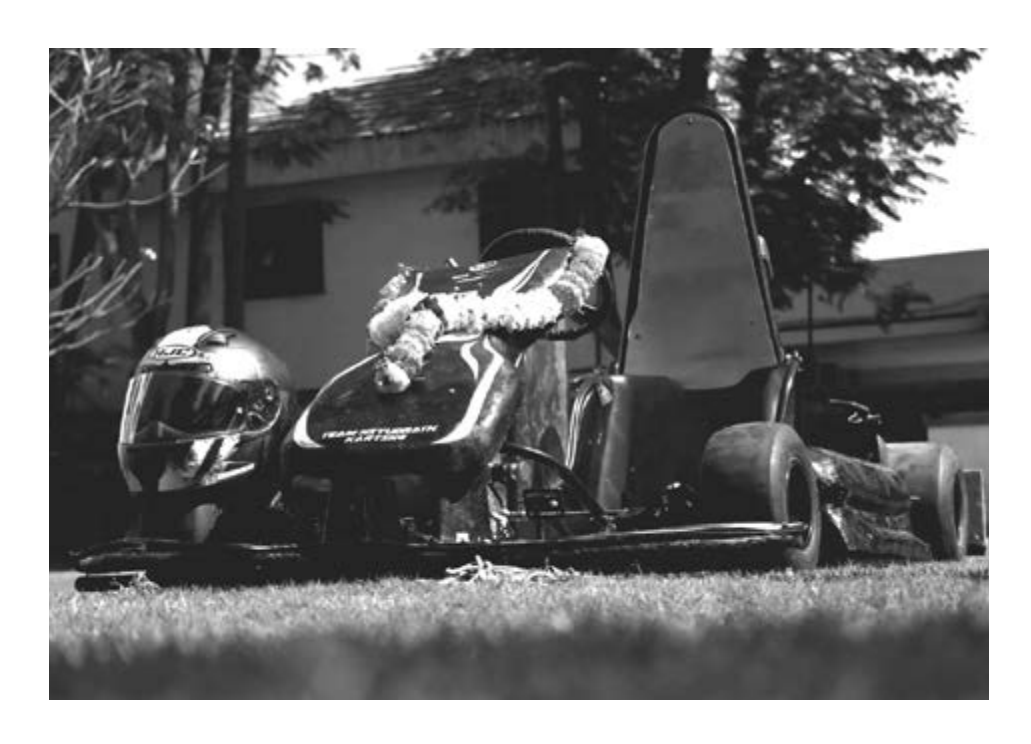
Team Niyudhrath achievement details: All India Rank: 15 RANKS