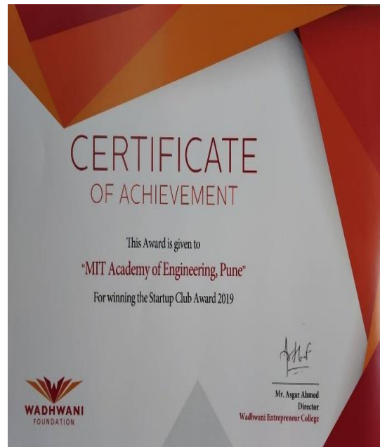
Start-up Club Award