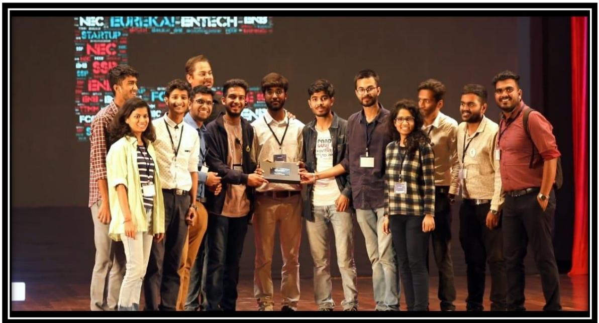
Winner at NEC-2019